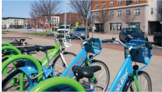
▲ Greenride Bikeshare is Vermont's first publicly available bikeshare system with bikes and stations located in Winooski, Burlington and South Burlington.

RPCs often engage in special projects that address unique community needs in many different areas such as flood resiliency, economic development, and transportation.