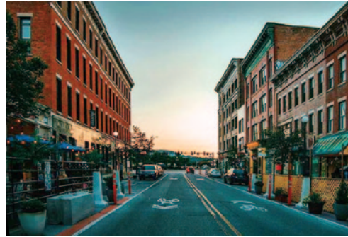
▲ RRPC led the redesign of Center Street in Rutland City.

Economic growth is supported best when development efforts are partnered with solid land use planning. The community infrastructure and development patterns that RPCs help plan for and create provide the foundation and public support for private economic development.